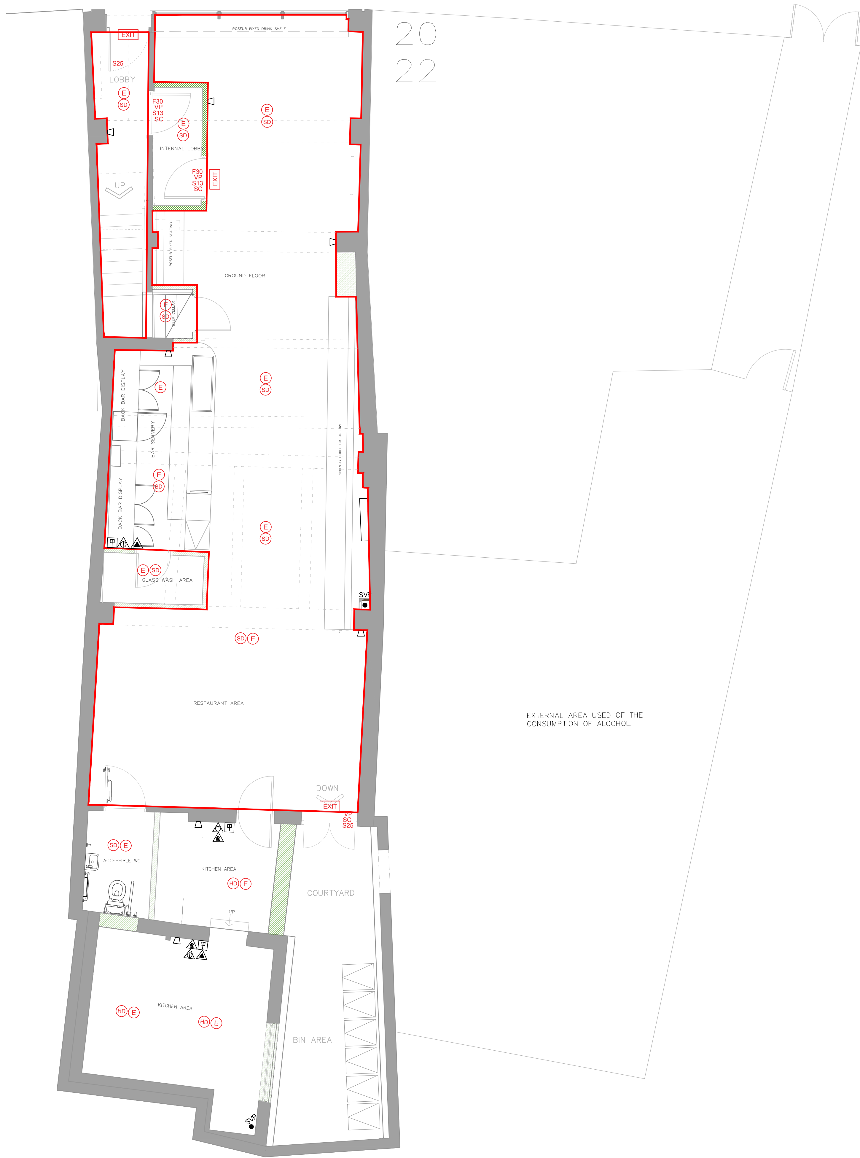
PROPOSED GROUND FLOOR PLAN SCALE: 1:50 @ A1